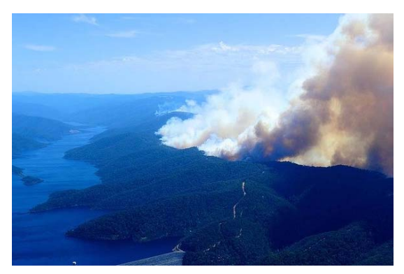
The Aberfeldie range where the fire raced along the firebreak with extreme heat intensity and speed. This fire was burning in burnt forest from the 2007 fires.

This submission only touches on the tip of the iceberg. There has never been a more critical time in history to act on these points than right now. We are already 30 years behind on this essential work.