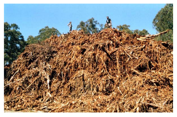
The logging slash piled along a fire break. It aids the wind tunnelling effect.

The boys club mentality must be reined in and managers with understanding of fire behaviour replace old foresters. The politics of fire must not override public safety. The ecology must not pay the price of maintaining an empire based on politically motivated fire management.