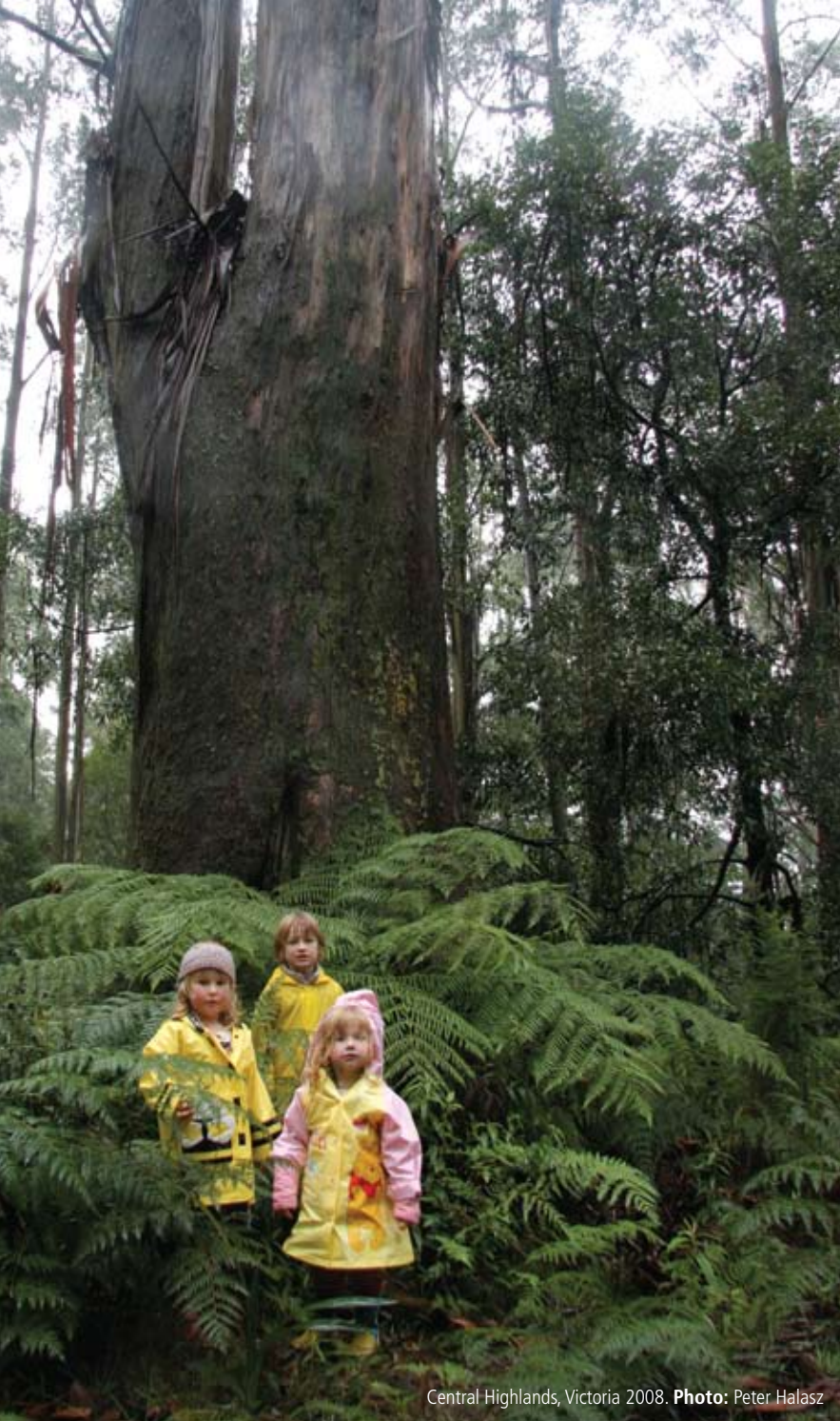
Central Highlands, Victoria 2008.

forests has a greater susceptibility to loss than that stored in natural forests as they have reduced genetic diversity and structural complexity, and therefore reduced resilience to pests, diseases and changing climatic conditions.'